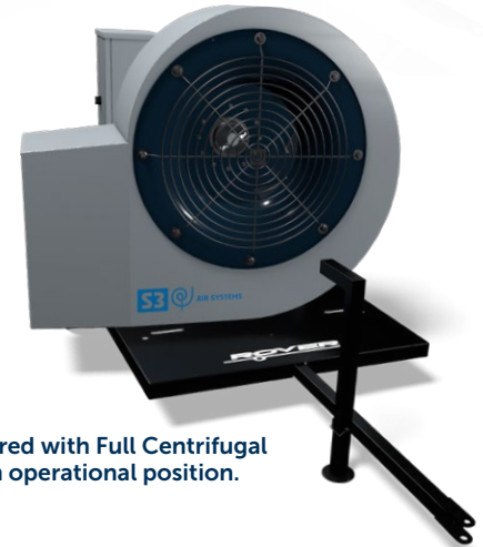
Pictured with Full Centrifugal fan in operational position.