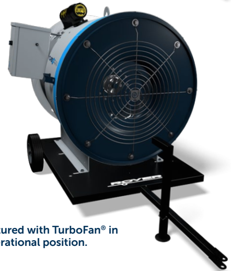
Pictured with TurboFan® in operational position.